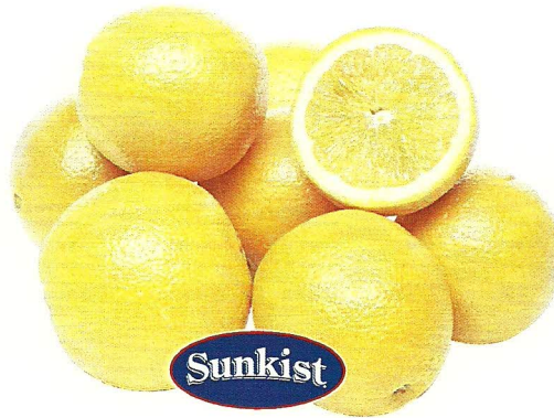
Sunkist Sweet Oranges